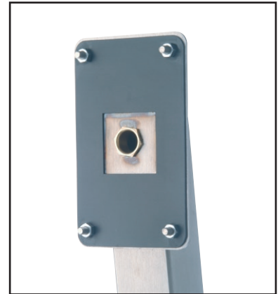
Fixing plate for HS housing